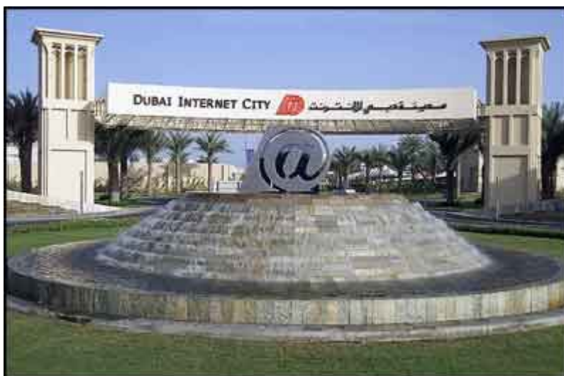
Dubai Internet City main entrance.

A key to our success is our strategic location, as Dubai located midway between Far East and Europe, proximity to the talents from sub continent and a pool of resources from all over the world, makes our offering most cost effective and at the same time maintaining a high quality services and performance.